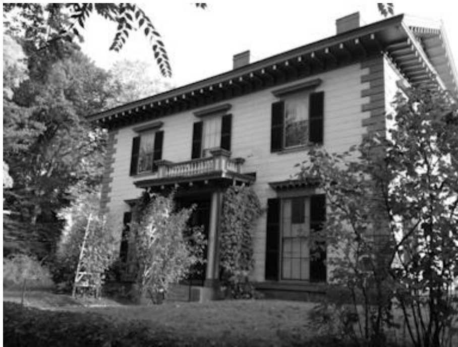
Figure 6: Boutwell House

In 2010, Boutwell house suffered two very serious water pipe failures which flooded portions of the museum's exhibition and work areas. The Board of Directors brought in several new members, wrote a long-range plan and applied for grants. These resulted in both a Community Preservation Act grant for $176,525 which was unanimously approved at Groton Town Meeting in April 2013, and a Cultural Facilities Fund grant for $79,000 awarded in November 2012 from the Massachusetts Cultural Council. Both of these grants were for physical renovations such as new wiring and plumbing, plaster replacement, a fire suppression system, and a new furnace.