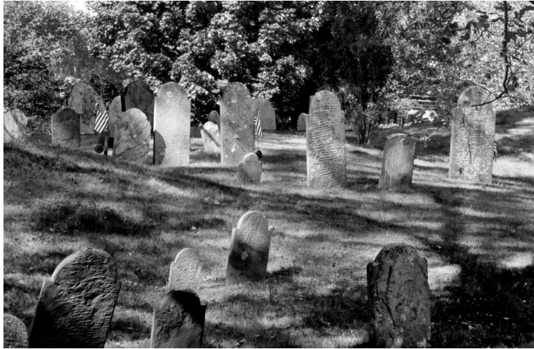
Figure 4: Old Burial Ground Footstones

In 2009 the Town approved the use of $2,850.00 in CPA funds to restore 29 broken headstones to their proper place in the Old Burying Ground near Town Center. See Figure 4 . Over time, these stones had been broken away from their original foundations leaving the graves without proper markings. With these headstones now correctly set, we can now accurately determine the legacy of those who made Groton their final resting place.