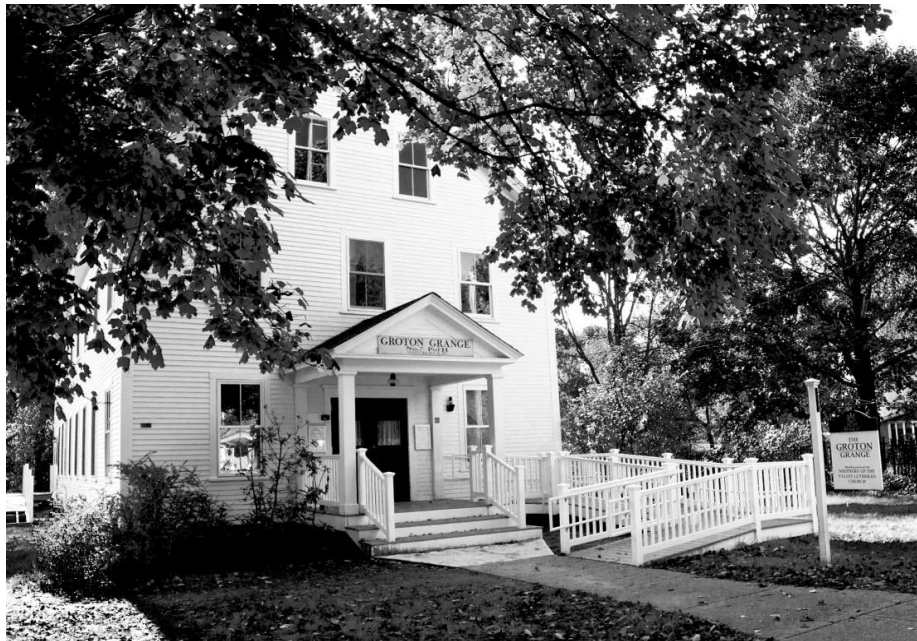
Figure 5: Groton Grange Hall

In 2009 the town approved the use of $137,000.00 in CPA funds to undertake a critically important preservation project at Groton Grange Hall, see Figure 5 . The Groton Grange Hall was originally constructed around 1890. The Groton chapter is the oldest functioning Grange in the Commonwealth, and its building has been an integral part of Groton's town fabric for nearly a century. This project, now completed, will allow the Grange to continue to make its facilities available for Town use for many years to come.