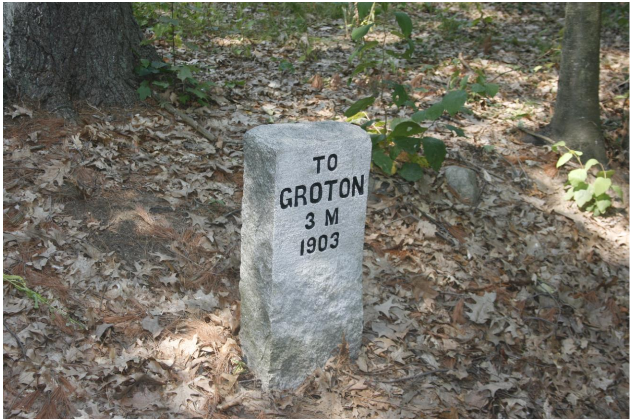
Milestone Restoration 2015

Prepared by the Groton Community Preservation Committee