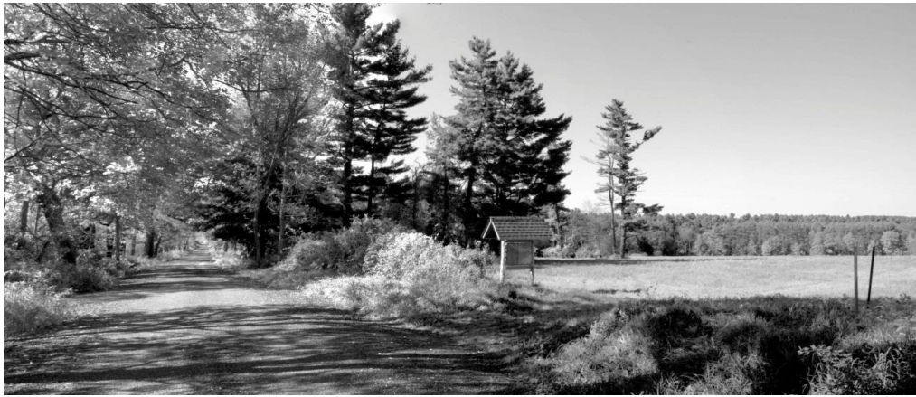
Figure 2: Surrenden Farm