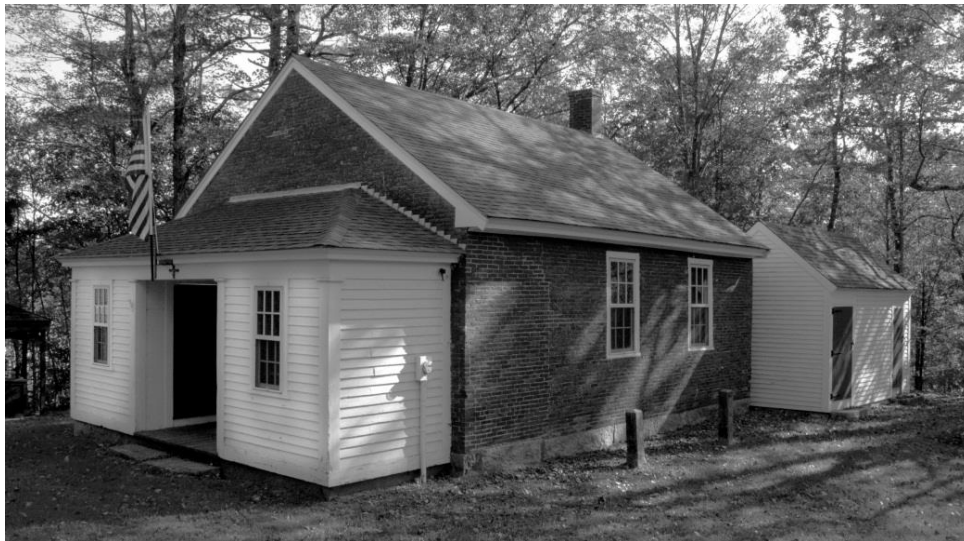
Figure 3: Sawtell School House

In 2006 the Town voted to approve the use of $18,500.00 in CPA funds for preservation of the Chicopee School #7 (aka Sawtell School). See Figure 3 . This school is listed on the National Register of Historic Places and is one of the last remaining original school houses in Groton. With private donations and volunteer labor, the Sawtell School Association used the CPA funds to successfully complete desperately needed preservation work on the school house. As a result, this school house can now safely accommodate tours of area groups and visitors.